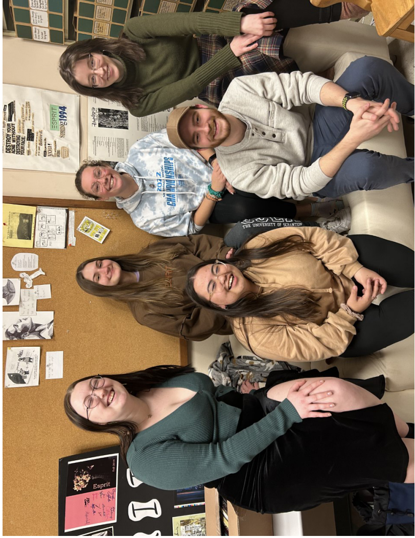
Production Team 2022