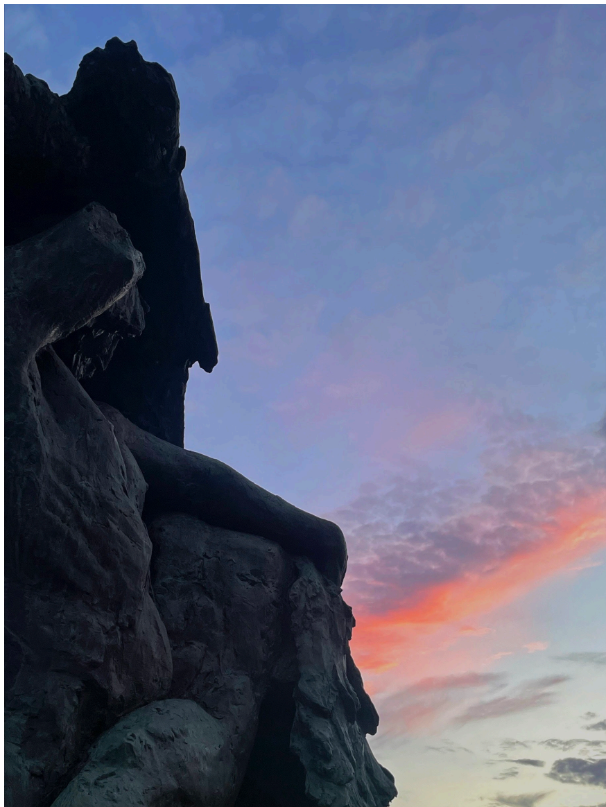
Genesis - Skye Rutkowski