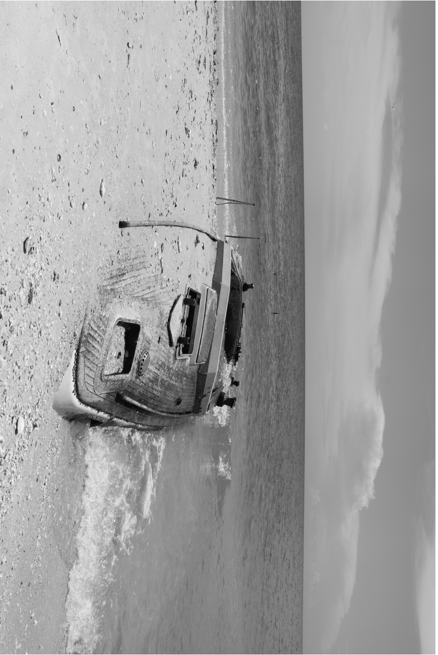
Swallowed By Sand - Sofia Zingone