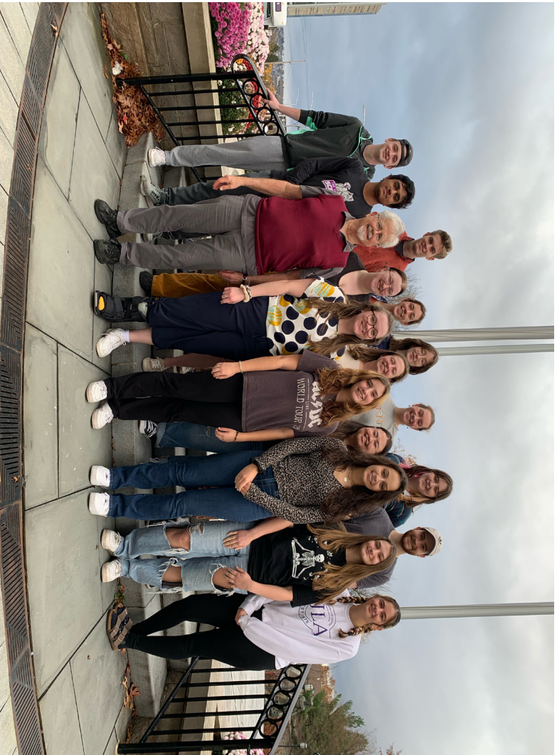
Esprit Staff Fall 2022