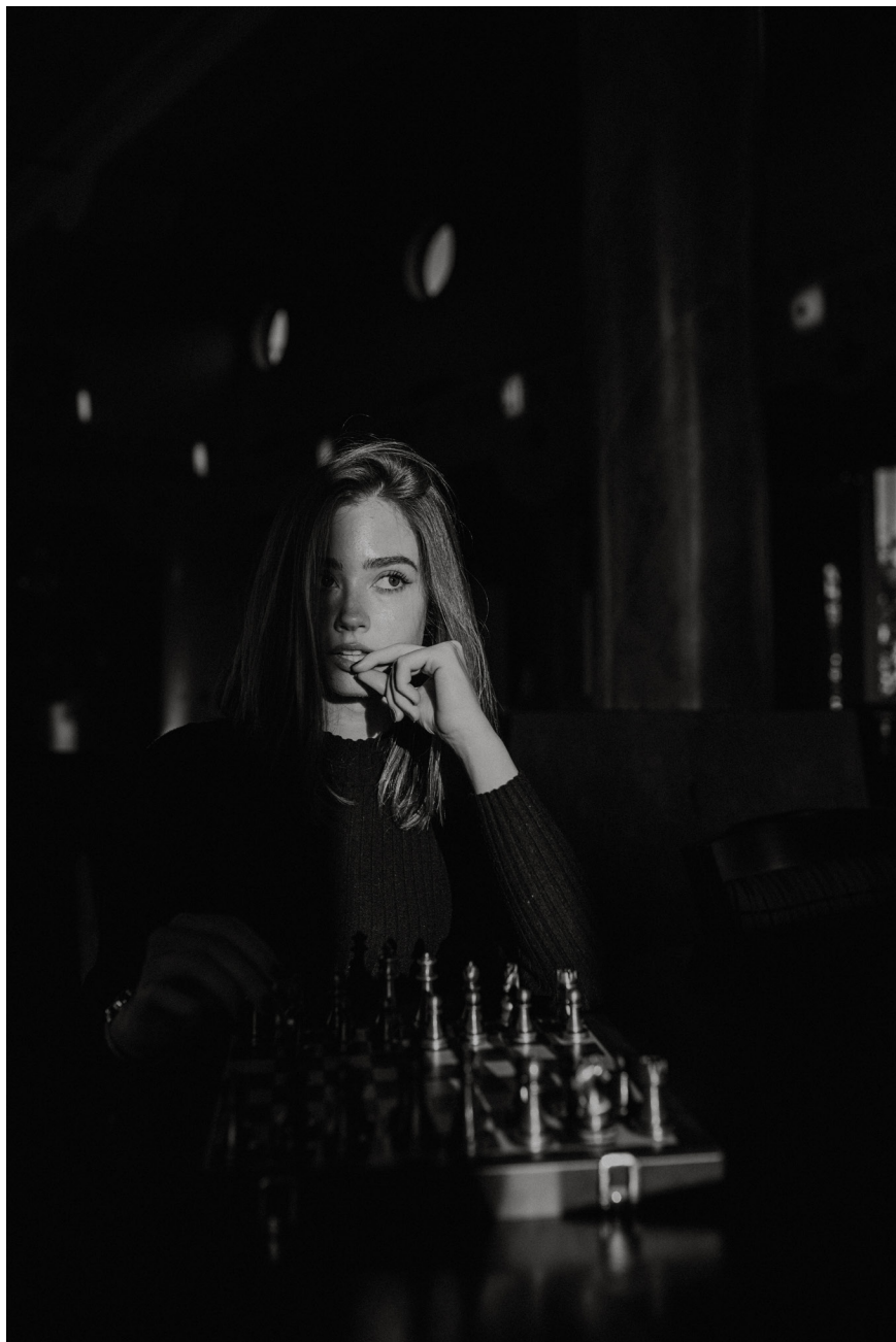
Queen's Gambit